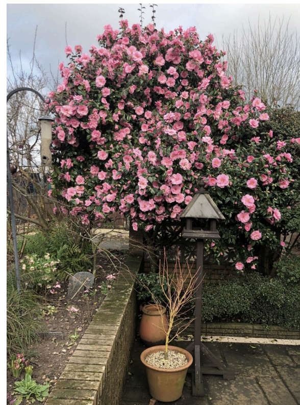
Timbercroft Close for Cardiac Rehab.